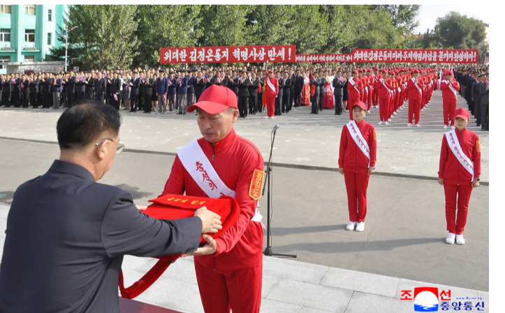
Mass rallies take place in all provinces to adopt letters of loyalty to the respected Comrade Kim Jong Un on the occasion of the 80th founding anniversary of the Workers' Party of Korea.