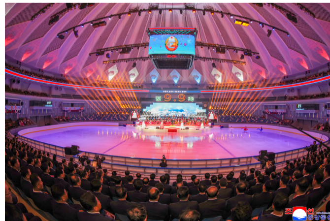
A performance is given at the Ice Rink in Pyongyang on September 9 in celebration of the 77th founding anniversary of the DPRK.

The performers presented a striking performance by newly creating and interpreting songs of patriotism and loyalty presented by the people to