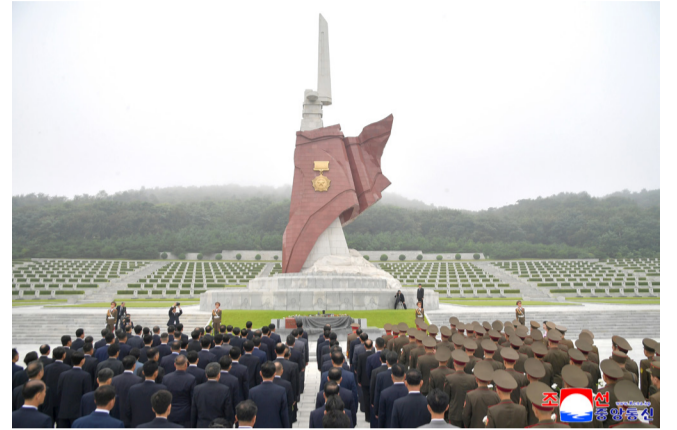
Flowers are laid before the Revolutionary Martyrs Cemetery on Mt Taesong, the Patriotic Martyrs Cemetery in Sinmi-ri and the Fatherland Liberation War Martyrs Cemetery on September 9, the 77th founding anniversary of the DPRK.

KCNA Flowers were laid before the Revolutionary Martyrs Cemetery on Mt Taesong, the Patriotic Martyrs Cemetery in Sinmi-ri and the Fatherland Liberation War Martyrs Cemetery