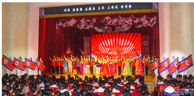
The Korean people spend an enjoyable national holiday across the DPRK.