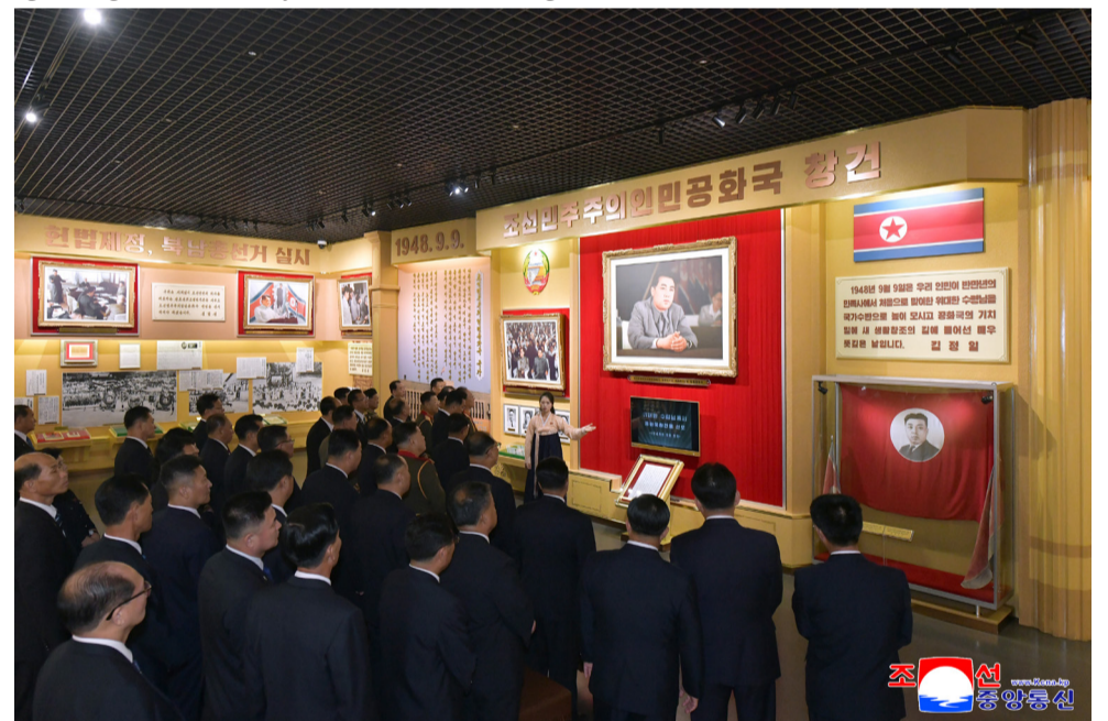
Senior officials of the Party and the government visit the Korean Revolution Museum on September 9.

All the visitors were full of burning enthusiasm to reliably carry forward for all ages the glorious history of the DPRK shining as a model in building a socialist state centred on the masses of the people, true to the leadership of the great Party Central Committee.