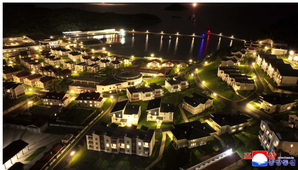
A ceremony for moving into new houses takes place at the modern Ragwonpho fishermen's residential district on September 4.