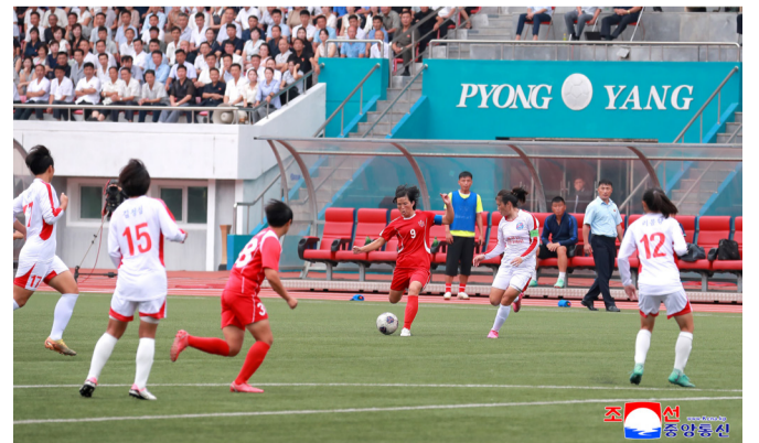
A women's football match takes place between the April 25 and Pyongyang teams at Kim Il Sung Stadium on September 8.

The women's football match between the April 25 Team and Pyongyang Team revved up the festive mood of the September holiday.