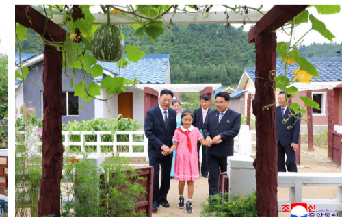
Agricultural workers move into new houses at the Sinyon Industrial Crop Farm of the Jagang Provincial Rural Economy Committee(left), the Kumya Farm in Changsong County of North Phyongan Province(middle) and the Unsong Farm of Jonchon County, Jagang Province(right).