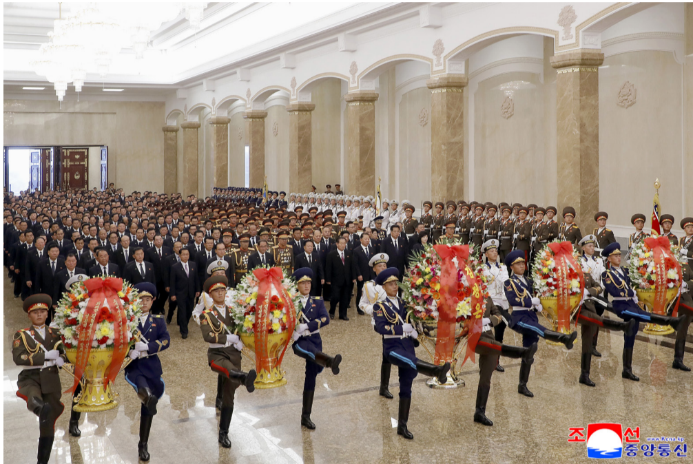
Senior officials of the Workers' Party of Korea and the government visit the Kumsusan Palace of the Sun on September 9, the 77th founding anniversary of the DPRK.