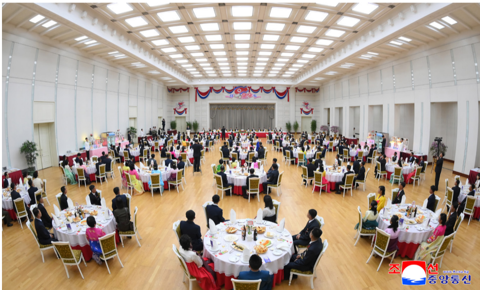
A reception is given for labour innovators and meritorious persons invited to the celebrations of the 77th founding anniversary of the DPRK at the People's Palace of Culture in Pyongyang on September 9.

KCNA A reception was given for labour innovators and meritorious persons invited to the celebrations of the 77th founding anniversary of the DPRK at the People's Palace of Culture in Pyongyang on September 9.